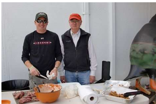
Posted 4-2-15: Throw Back Thursday: M&M Lumber Fish Fry - 2009