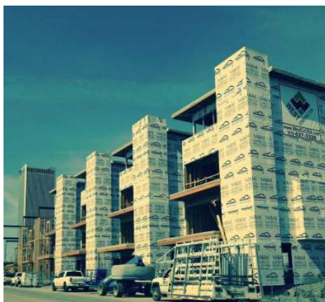
Posted 3-25-15: Great looking building downtown by West Construction!!

Join in the Facebook fun: https://www.facebook.com/mmlumber