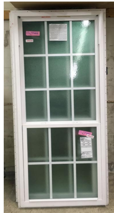
2/6x6/0 Ser 160 White vinyl Single hung window with obscure glass, Low-E and Argon 3 - Available $202.89 ea SKU: 2660160WSH