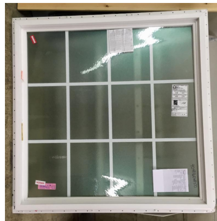
4/0x4/0 Ser 160 White vinyl 4x3 Picture window with obscure glass, Low-E and Argon 1 - Available $256.45 ea SKU: 4040160WPICO

Congrats to Zack on the arrival of his baby girl. Skyla was born February 17 and even made a visit to M&M Lumber already!!