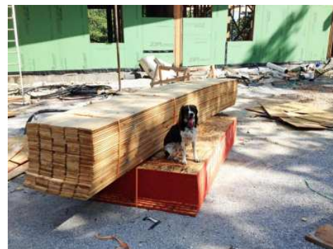
Posted 7-13-15: Have you meet M&M Lumber's newest delivery girl? Vesta, a little Brittany Spaniel helped make a delivery yesterday with Sean out at Grand Lake.