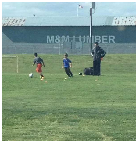
Posted 7-23-15: Guess what soccer players and parents get to look at while at soccer practice... Oh the lovely sight!!